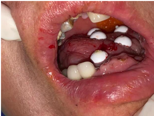
Figure 2. The used catheters.

evaluated by observing the three-dimensional dose distribution in the dose-volume histogram. Based on the dose-volume histogram information, the treatment plan was optimized to deliver the prescribed dose (minimum peripheral dose) to cover at least 95% of the clinical target volume (PTV). In contrast, the mandibular dose was kept as low as possible to minimize the risks of radio-osteosclerosis.