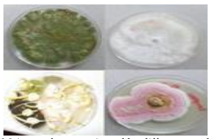
Figure 1. Maize seeds contaminated by different mould on PDA media with pure isolated cultures