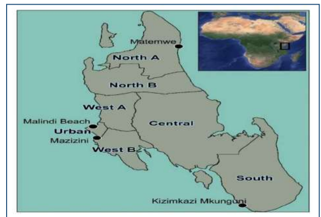
Figure 1. Map of Unguja showing the sampling sites.

Regions and seven Districts. The data was collected from four landing sites located in four Districts. The landing sites are – Matemwe from North A, Malindi Beach from Urban, Mazizini from West B, and Kizimkazi Mkunguni from South. The data was collected between February and March 2023. These selected landing sites are the very common and busiest landing sites in each district. Locations of the landing sites are shown in the map below (in Fig. 1).