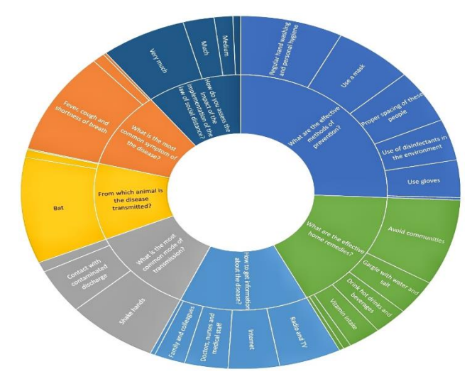
Figure 1: Sunburst chart of answers to questions of level of knowledge