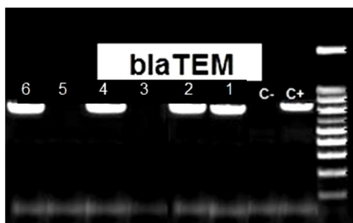
Figure 2: Agarose gel electrophoresis of bla TEM Polymerase Chain Reaction products using 100 bP DNA ladder. Lane C+: positive control; lane C-: negative control; lanes 1, 2, 4, and 6: isolates with bla TEM genes; lanes 3 and 5: isolates without bla TEM gene.