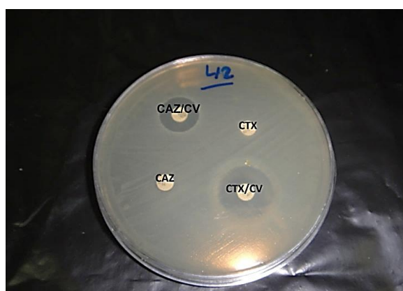
Figure 1: A positive extended-spectrum beta-lactamase-producing Escherichia coli using combination disk method (Confirmation test)