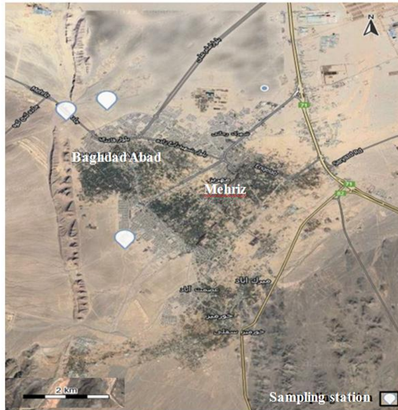
Figure 1: The location of the studied stations in Mehriz city.

It should be noted that the three mentioned points are water reservoirs used for water supply, from which sampling was done (the upper two points are related to Miankoh and Movahedin