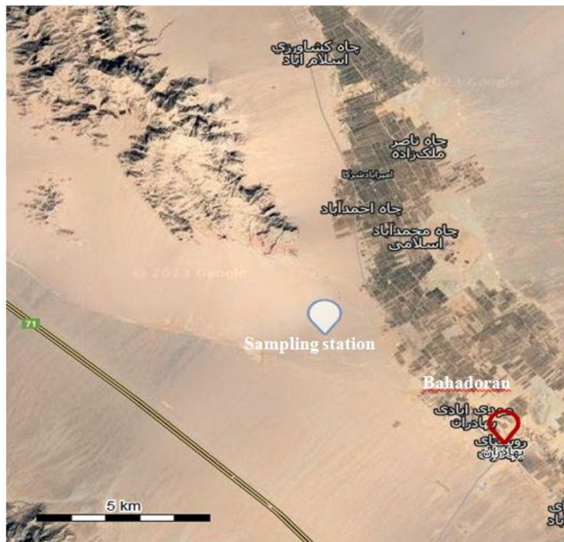
Figure 2: The location of the studied stations in Bahadoran district.