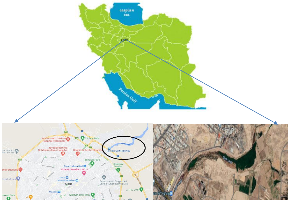
Figure 1: Location of the study area