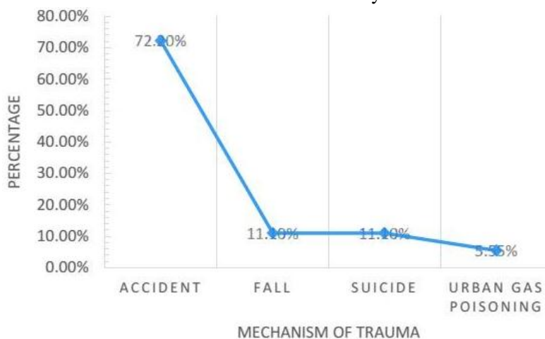
Figure 4. Frequency of Deaths Based of Mechanism of Trauma in Stratified Cluster Sampling

network scale-up method, the annual incidence of death caused by trauma was 3.47 per 1000 person-years. Figure 4 shows the frequency of deaths caused by trauma in stratified cluster sampling.