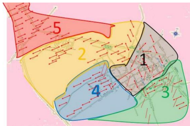
Figure 1. Locations of the Cluster of Areas on the Map of Kashan

In this population-based cross-sectional study, individuals above 15 residing in Kashan during 2018-2019 were studied. In this study, the sample had two methods :a two-stage Cluster stratified design' and a network Scale-up method 5,16,17 . In stratified cluster sampling methods, Kashan was divided into five areas according to the socioeconomic status on the geographical map of Kashan, and cluster of each area was defined on the map. Figure 1 shows the Cluster of each area. According to the population of each area, the sample size was determined in 5 areas. This sample size was divided into 25 individuals per cluster to determine the required number of clusters. All clusters in each area were numbered, and the clusters were randomly selected. In each cluster, between five houses in the first cluster, one house randomly has been selected, and systematically the 25 houses were next, have been surveyed. From all Clusters in each area, 25 households were studied 18,19 .