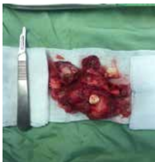
Figure 6. Samples taken from the patient's maxilla with a gelatinous appearance.