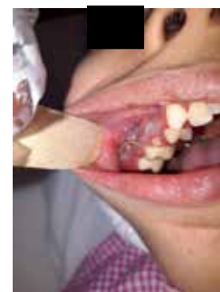
Figure 2. Bone lesion in the buccal cortex extending from the right external incisor to the second molar.