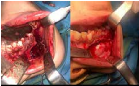
Figure 5. Lesion and its location during the inoculation and curettage surgery.