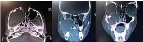
Figure 4. CT-Scan with axial and coronal views showing the lytic lesion with expansion and thinness of the overlying buccal cortex with radiopaque foci throughout the lesion.