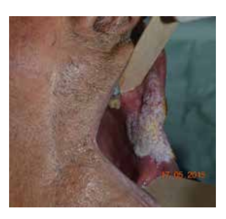
Figure 9. Leukoplakia verruciform type (Squamous cell carcinoma was proven by incisional biopsy).