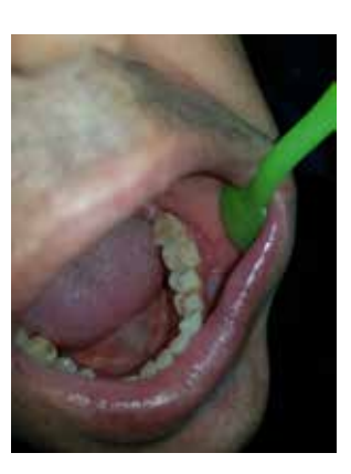
Figure 11. Erythroplakia of lower vestibule.