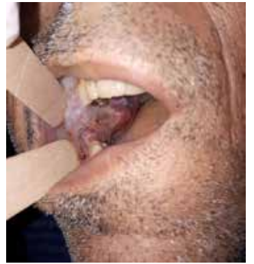
Figure 4. Squamous cell carcinoma of the lower alveolar ridge and buccal mucosa.

Figure 3. Squamous cell carcinoma of the floor of the mouth.