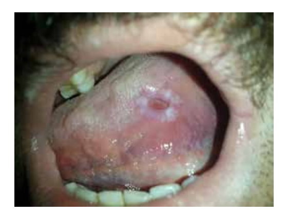
Figure 7. Ulceration of the lateral border of tongue.