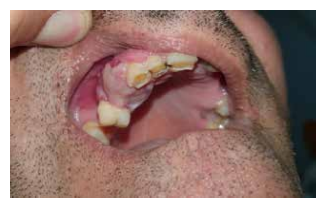
Figure 5. Squamous cell carcinoma of the upper alveolar ridge.