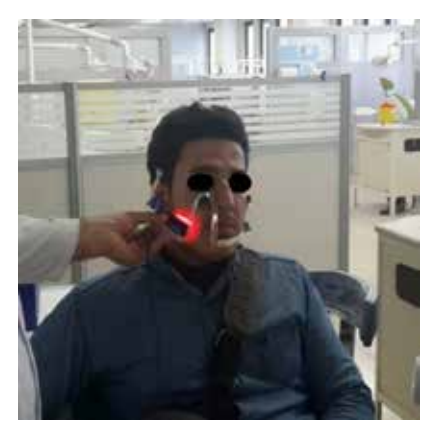
Figure 1. Extraoral LED phototherapy after surgical removal of an impacted mandibular third molar.

The main objective of this study was to assess the effect of LED phototherapy on pain and trismus following surgical extraction of impacted mandibular third molars. For assessment of trismus, the maximum mouth opening (MMO) was measured by a millimeter-scale ruler by one operator (Figure 2). For this purpose, the distance between the incisal edge of the maxillary and mandibular right central incisors was measured in all patients in both groups preoperatively and at 7 days postoperatively. The patients were requested to open their mouth as wide as they can. Also, each measurement at each session was repeated 3 times, and the maximum value was recorded in millimeters to increase the accuracy of the results.