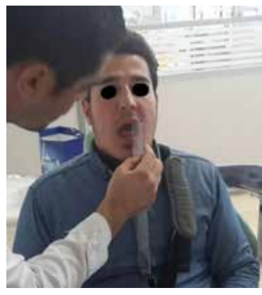
Figure 2. Measuring the maximum mouth opening (distance between the incisal edge of the maxillary and mandibular right central incisors) by a millimeter-scale ruler.

For assessment of pain using the numerical rating scale, the patients were requested to express their level of pain by choosing a score from 0 (no pain) to 10 (worst pain imaginable). The severity of pain was assessed at 6 h, and 2 and 7 days, postoperatively. Selection of these time points was due to the fact that pain after third molar extraction surgery reaches its maximum level after 3 to 5 h, continues for 2-3 days, and then gradually subsides by day 7 [13].