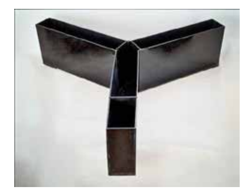
Figure 1. Y-maze used in this study.

Phase 2: In this phase, the Y-maze test was performed 3h after the injection of biperiden and LPS to assess the spatial working memory and learning of rats. Several models are employed to assess the trend of learning and memory of laboratory animal models considering the effect of medications on memory and the major role of hippocampus in spatial memory [8]. A plexiglass Y-maze was used in this study; each arm of the maze measured 15cm (width) x 30cm (height) x 40cm (length). The arms merged at the center (Figure 1) [9].