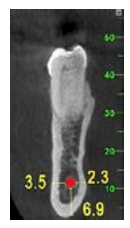
Figure 2. Measurement of distance from the MIC to the buccal, lingual and inferior border.

According to the anatomical definition of MIC, it includes areas with opaque border around the canal [3]. The initiation point of MIC was determined to be the area where canal diameter was less than 3mm. Next, cross-sectional slices were obtained from the initiation point of MIC to its termination point, i.e. the last cross-sectional scan with an opaque border. Measurements on MIC were made at 3mm intervals. The distance from the MIC to the inferior border of mandible was measured from the most-internal part of the inferior cortical border of MIC parallel to the axial plane and perpendicular to the most external part of the inferior border (Figure 2).