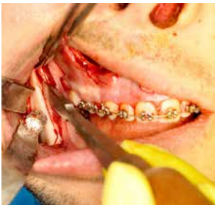
Fig. 1. 12-mm-wide Lexer bone chisel is used to tap along the medial ramus area in most superior and posterior site of osteotomy.

So at first we need to make sure about first point at the highest end of osteotomy site in medial ramus area. The osteotomy is then finished at the anterior second point at vertical buccal cut with chisel, taking care to protect soft tissues with channel retractor (Fig 3, 4). In our over 200 BSSO experience, without manipulation of mid-oblique bone cut with ostetomes at external oblique ridge area, the splitting of mandibular segments is successfully done. The risk of direct IAN injury increases by direct handling of nerve during BSSO procedure [6]. Therefor performing the osteotomy at oblique cut area, where the nerve is crossing through the mandibular body, should be prevented (Fig 5). Theodossy found that timing of surgery more than 3 hours could be a risk factor for infection [7]. Confining the osteotomy into two most significant sits of mandible, who the success of splitting is depends on, could be time saving in BSSO procedure.