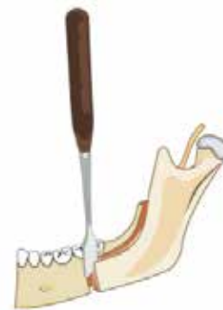
Fig 4. Anterior second point osteotomy was made along buccal cortex area by bone chisel.