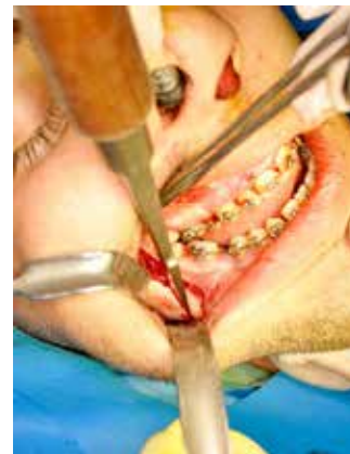
Fig 3. The bone chisel is keeping just inside the buccal cortex, taking care to support the mandible at the inferior border with the channel retractor.