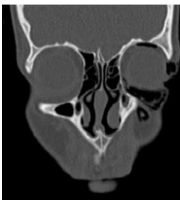
Fig 3. Showing axial and sagittal and coronal cuts showing presenceof air in subcutaneous tissues.