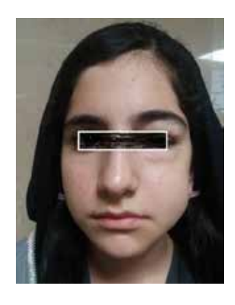
Fig 1. Subcutaneous emphysema on right side of face.

The patient was hospitalized for three nights and her vital signs were continuously monitored during her admission in the hospital. Serum Dextrosaline was given intravenously. Antibiotic therapy first generation Cephalosporin such as Cephazolin one gram IV QID and along with the antiprotozoal drug like Metronidazole 500mg IV TDS were properly administered. The patient was discharged after complete confirmation of no visible signs of swelling and crepitations of the face.