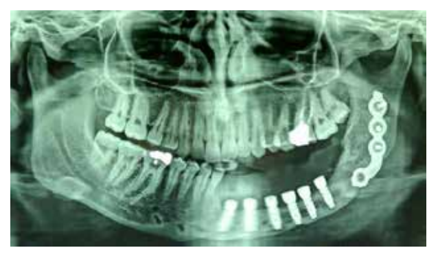
Fig 2. Implants inserted in free iliac graft.