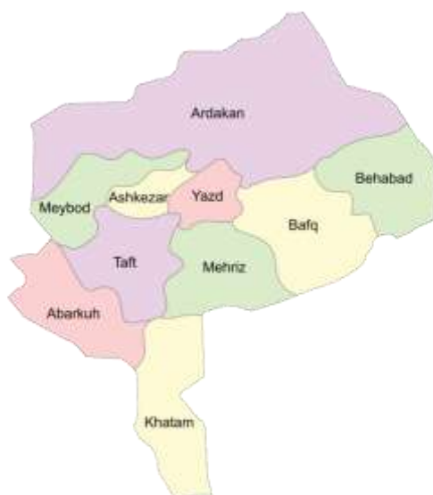
Figure 1. The geographical map of the cities of Yazd province in Iran

Area 10 includes: Qasem Naghi - Dehno - Seyed Mirza - Mohammadabad - Fahraj