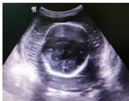
Figure 4. Obstetrical ultrasonography indicates fetal scalp oedema at 24 weeks POA