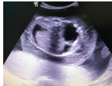
Figure 5. Obstetrical ultrasonography indicates fetal ascites at 24 weeks POA