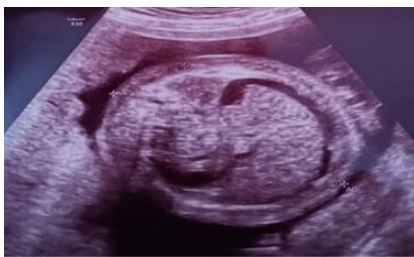
Figure 2. Obstetrical ultrasonography indicates fetal ascites and thick abdominal wall at 28 weeks POA