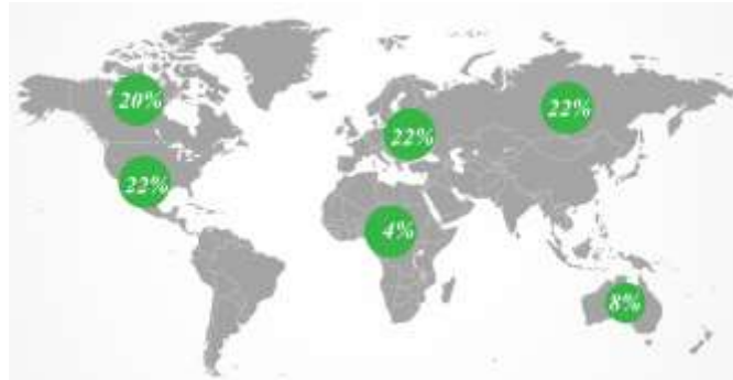
Figure 2. Dispersion map of the reviewed articles around the world