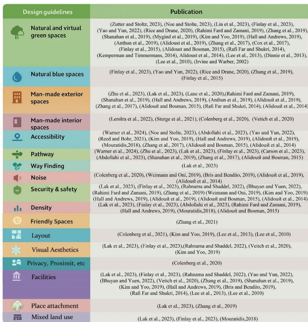
Table 2. Summary of design guidelines related to social health

openness, connectivity, and designated social areas—affects how individuals engage with one another. For example, the inclusion of shared lobbies and common rooms in apartment complexes has been favorably received for fostering social interaction. Well-planned layouts can promote a sense of community while supporting both private and public engagement (9, 22). In sum, these findings underscore the profound influence of environmental design on diverse dimensions of social health. Summary of design factors related to social health based on the names of authors who worked in this field and the number of publications referring to design factors are shown respectively in Table 2.