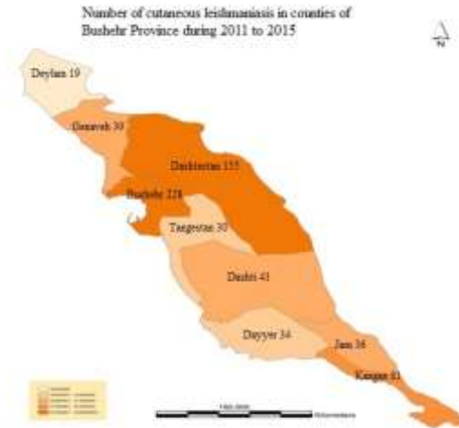
Figure 2. frequency distribution of cutaneous leishmaniasis in Bushehr province

frequency. According to this figure, the highest frequency belonged to Bushehr County and the lowest frequency belonged to Deylam during these 5 years. (Figure 2)