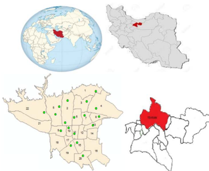
Fig. 1. Geographic location of studying area

This study was conducted in 2015. 18 out of 21 monitoring stations with sufficient and valid data were evaluated. The stations belonged to the Air Quality Control Company (AQCC). The evaluated parameters were included CO, NO 2 , SO 2 , PM 2.5 , PM 10 , O 3 and AQI. All parameters were divided into 6 categories from 0 to 500 according to their breaking point (as AQI). The geographic location of this stations is shown in Fig. 1. In the next step, the SPSS and the Kolmogorov-Smirnov test were used for statistical analysis of the data. Then for each air pollutant concentration, using deterministic (inverse distance weighted, local polynomial, global polynomial, radial basis functions) and geostatistical (Kriging and Cokriging) methods (according to the variability of powers and methods), overall with 71 methods, the RMSE value was obtained using cross-validation. Then, with the lowest RMSE value, the best interpolation method was selected and zoned by GIS9.3.