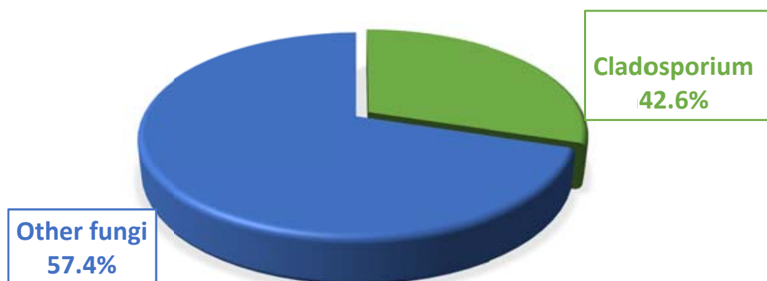
Fig. 1. The total Cladosporium concentration during the study

Fig. 2 presents the mean concentrations of Cladosporium spores according to CFU/Plate/h in different sampling points. As shown in this chart, the highest and lowest concentrations of Cladosporium were related to the primary sludge dewatering basin and aeration tank with an average emission of 30.3 and 16.4 CFU/Plate/h, respectively. The statistical tests showed a significant difference between the concentration of Cladosporium as CFU/Plate/h in the office building and ambient