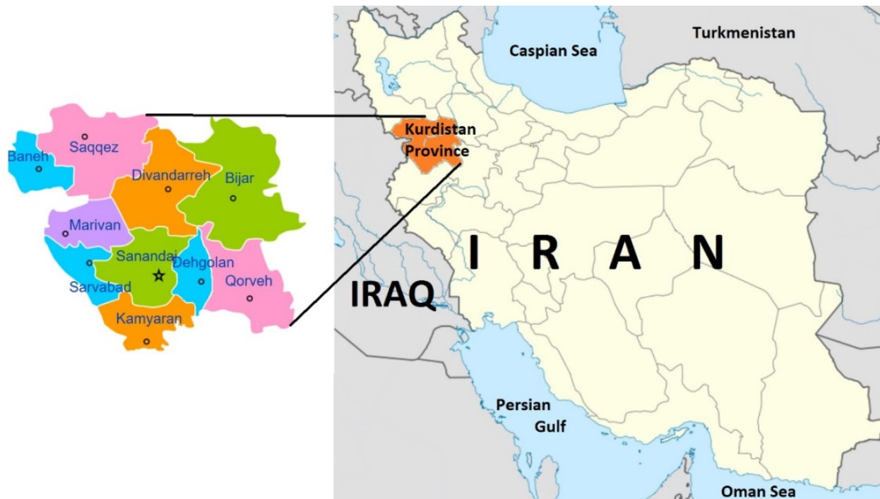
Fig. 1. The study area, Kurdistan Province is located in west part of Iran

The coordinates of collection sites have presented in Table 2.