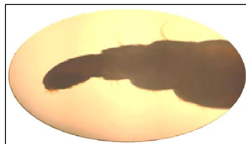
Fig. 2. The head of Psychoda albipennis (Original, Hazratian 2018)