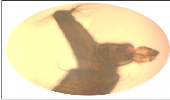
Fig. 3. The siphon of Psychoda albipennis (Original, Hazratian 2018)