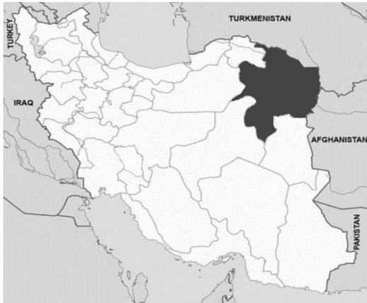
Fig. 1. Map of Iran shows the location of Khorasan Razavi Province (the black area)