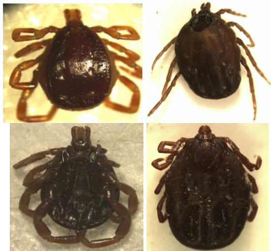
Fig. 2. Hyalomma marginatum (Male, above and Female, below)