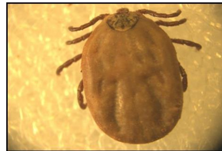
Fig. 4. Dermacentor raskemensis (Female)