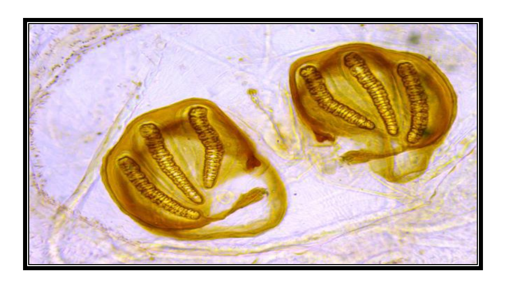
Fig. 4. Sarcophaga argyrostoma, third instar larva, posterior stigma, Entomology lab Selçuk University, August 19, 2018