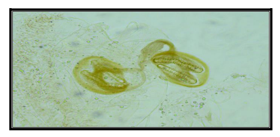
Fig. 3. Sarcophaga argyrostoma, second instar larva, posterior stigma, Entomology lab Selçuk University, August 19, 2018