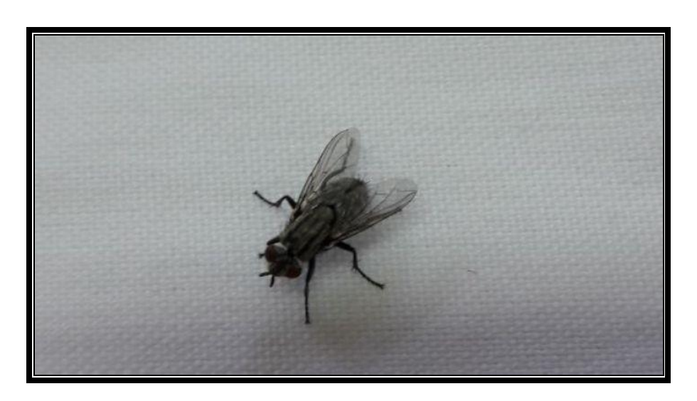
Fig. 1. Adult fly of Sarcophaga argyrostoma appeared in Parasitology lab, Ghaem hospital, Mashhad, July 20, 2018

In the Entomology lab at Bozok University, genital dissection of the adult male was performed under Leica S8APO stereomicroscope; only the fifth abdominal sternite was softened for 24h in a cold solution of 10% KOH to facilitate the further dissection. Identification, classification, and terminology followed and, the specimen was identified as S. ( Liopygia ) argyrostoma (Fig. 7) (12). Digital photos of the genitalia were captured with Leica MZ 125 camera mounted stereo zoom microscope and Leica application suite (ver. 3.8.0).