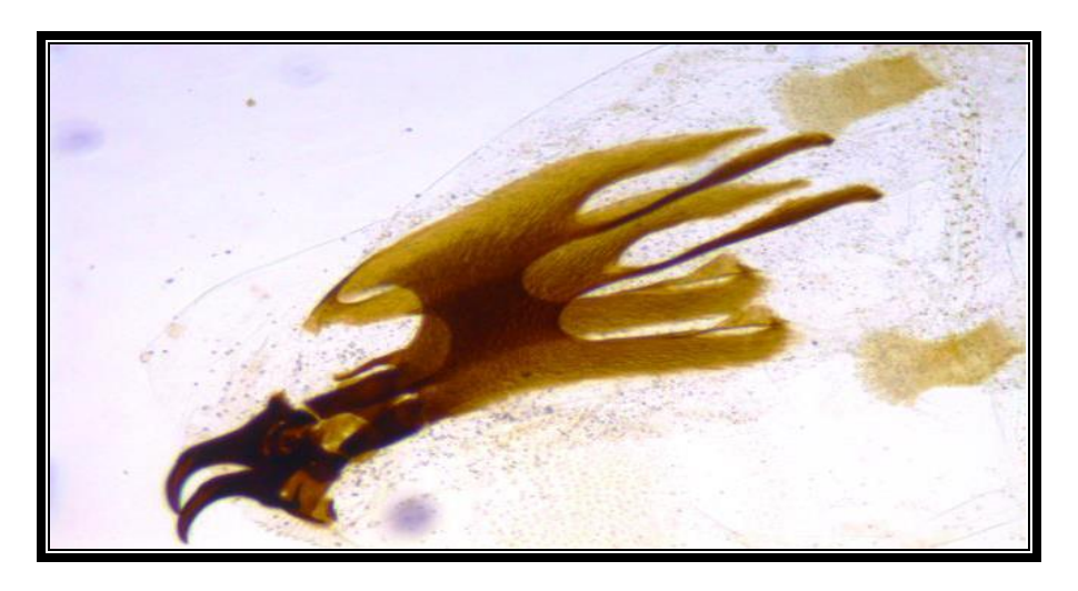
Fig. 5. Sarcophaga argyrostoma , second instar larva -cephaloskeleton and anterior stigma, Entomology lab Selçuk University, August 19, 2018