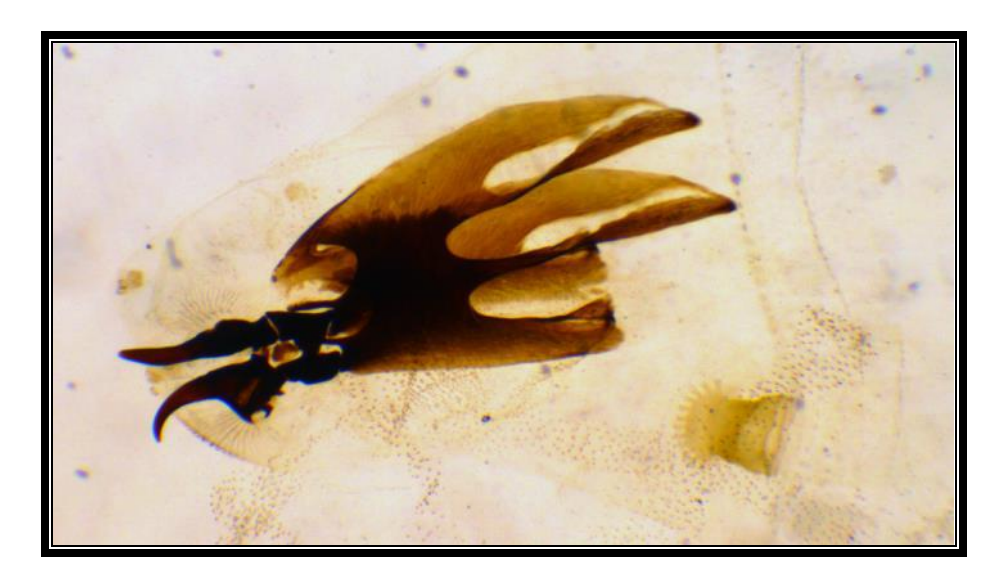
Fig. 6. Sarcophaga argyrostoma , third instar larva, cephaloskeleton and anterior stigma, Entomology lab Selçuk University, August 19, 2018