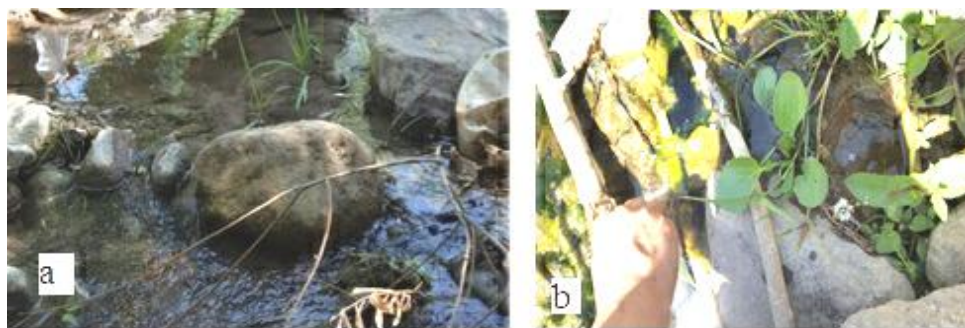
Fig. 2. (a, b) Two sampling sites, Aghbolagh River, East Azerbaijan, Iran