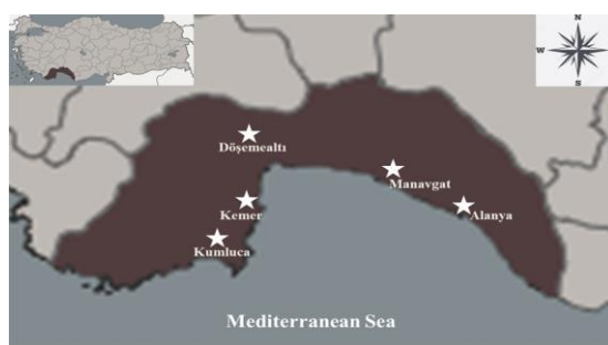
Fig. 1. Culex pipiens collection sites in various districts of Antalya Province, Turkey in 2017