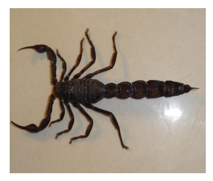
Fig. 3. Photo of a Androctonus crassicauda (Buthidae) in Iran