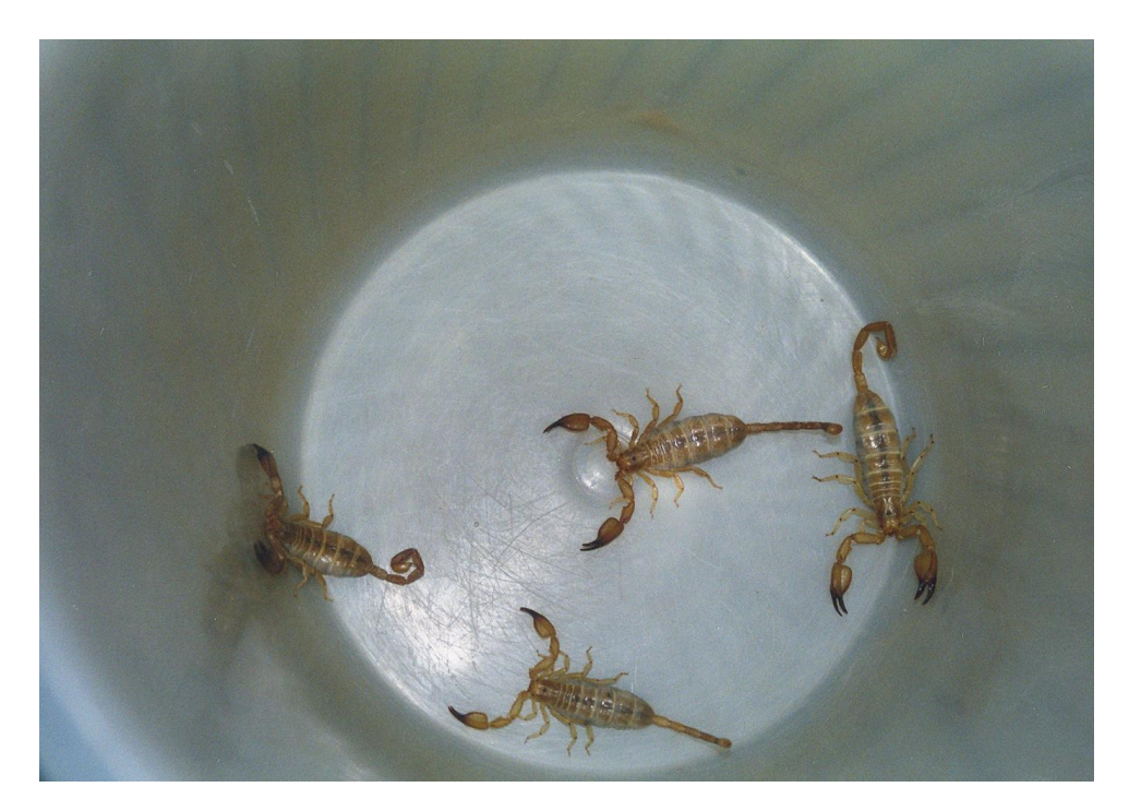
Fig. 1. Photo of four live Hemiscorpius lepturus (Hemiscorpiidae) in Iran