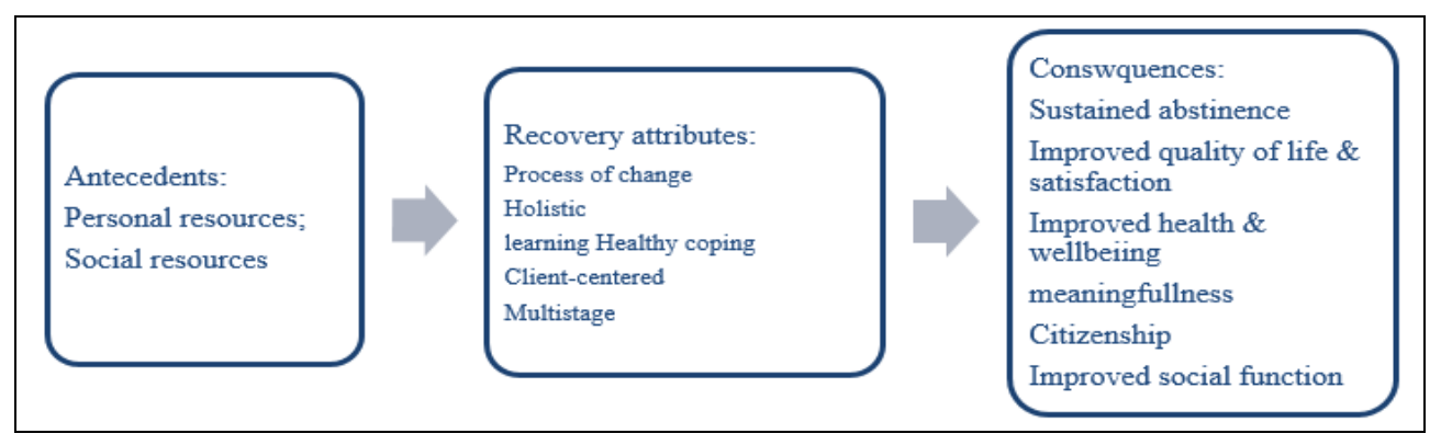
Figure 2. Antecedents and Consequences of Addiction Recovery