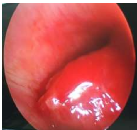
Figure.2. An intraluminal mass was observed in the proximal bronchus intermedius in Bronchoscopy.