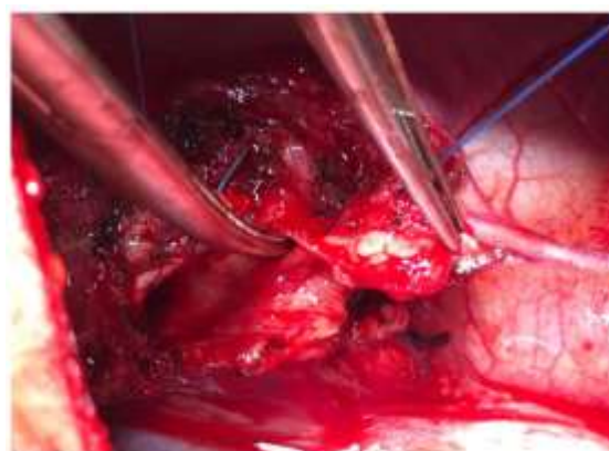
Figure.4. Middle lobe lobectomy was done due to intermedium bronchus involvement.