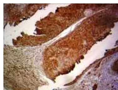
Figure 3. Pathology report indicated the presence of a low-grade spindle cell, Antoni A and B areas, and diffusely positive for S-100 protein.