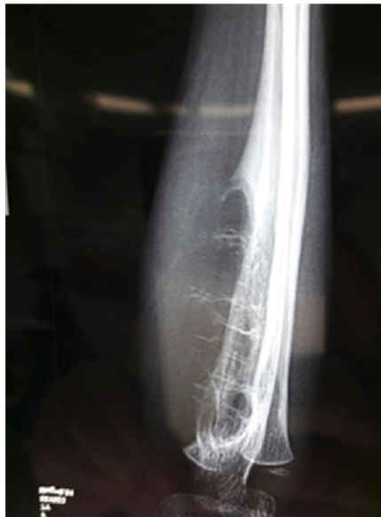
Figure1. X-ray image showing bone tumor in ulna that destructs the one cortex and fine bony trabeculation the extend to soft tissue.

It should be noted that bone KHE could be misdiagnosed as juvenile hemangioma,