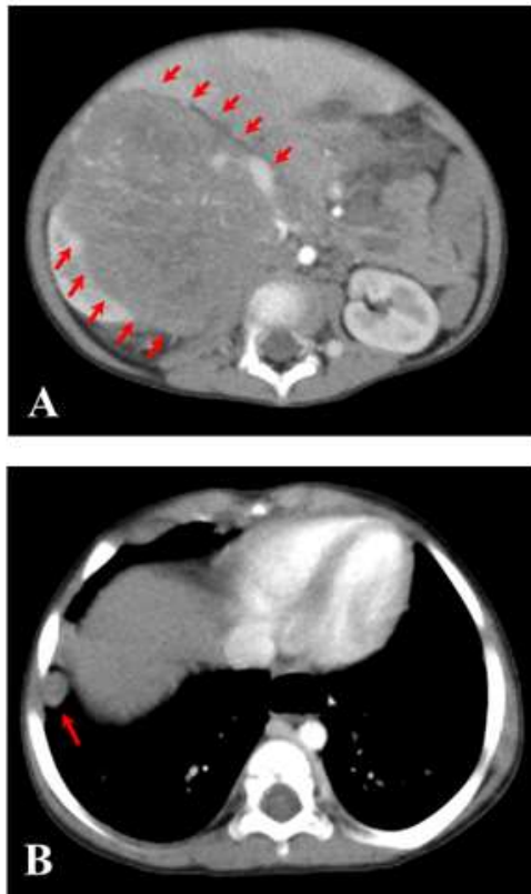
Figure 1. Axial CT Scan of the chest and abdomen without contrast-enhanced. (A): Right heterogeneous enhancing mass lesion with extension to the kidney at the same side, that had crossed mid-line with no obvious calcification. (B): Two nodules with a diameter of 12 mm in right lung showing secondary pulmonary metastatic lesions of mass.

of clinical manifestations of the patient, CT scan was again conducted that the mass size had been reduced to 98×6 mm, but vascular encasement and compressive effect on adjacent organs could still be observed. The patient was transferred to the operation room for the second time for mass resection, but due to inferior vena cava (IVC) invasion, there wasn't the possibility of complete removal of the mass. So, the patient was admitted to the hospital for further chemotherapy and is currently continuing chemotherapy.