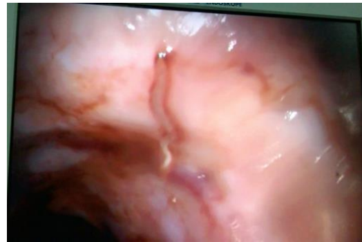
Fig. 1: Trichuris vulpis worms

On endoscopic visualisation numerous T. vulpis whipworms were found attached to the colon mucosa (Fig. 1).