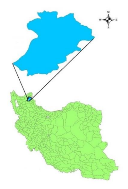
Fig. 1: Meshginshahr County (area of study) in Ardabil province, North West of Iran.

Ardabil Province is located in the North West of Iran and Meshginshahr County is located in Ardabil Province (Fig. 1).