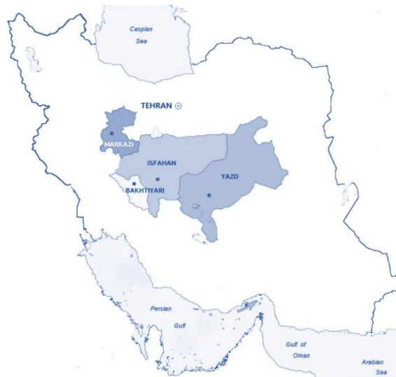
Fig. 1: Studied provinces in central Iran including Isfahan, Yazd, Markazi, and Chaharmahal and Bakhtiari