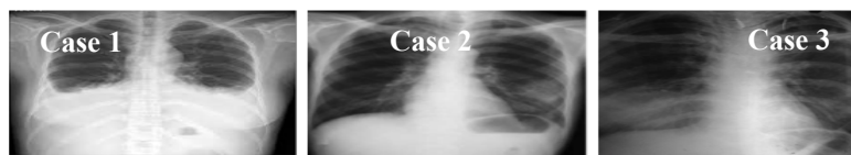
Fig. 1: (Case 1). Chest radiograph revealed mild fluid accumulation in both lungs and irregular opacities in the upper right lung, (Case 2). X-ray chest revealed an alveolar infiltrate in the left lower lobe, (Case 3). Chest X-ray revealed consolidation in the right lower lobe

Case 3: A 25-year-old HIV-positive man presented with a wet cough, constant fever with chills, dyspnea, watery diarrhea, nausea, and weight loss. Physical examination was unremarkable, and Chest X-ray revealed consolidation in the right lower lobe (Fig. 1). Microscopic examination revealed the presence C. parvum using nested-PCR-RFLP (primers listed in Table 1). Respiratory cryptosporidiosis was diagnosed after thorough investigations (Table 2). Also, a diagnosis of concurrent infection with disseminated MAC infection was established based on laboratory and clinical findings. Despite treatment, his condition rapidly deteriorated, leading to death (Table 3).