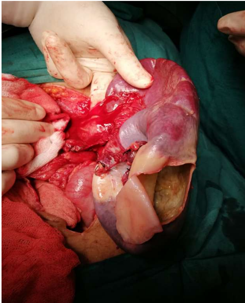
Fig. 4: Mobilised spleen delivered through wound before dividing pedicle showing ruptured cyst

Exploratory laparotomy was done. Intra operative findings were an enlarged spleen with a ruptured cyst, approximately 10 x 8 cm in the inferomedial aspect with membranes seen exuding through the site of rupture (Fig. 4). Dense adhesions were found between cyst, omentum and stomach. About 600 ml off white, turbid fluid was found in abdomen and pelvis. Liver and other intra-abdominal viscera were grossly normal. Splenectomy followed by peritoneal lavage and scolical irrigation was carried out. Drains were placed in splenic fossa and pelvis. Post-operative period was uneventful. On follow up patient is doing well. Follow up USG is unremarkable. Histopathological examination confirmed hydatid cyst of