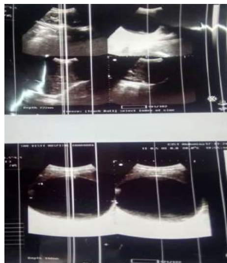
Fig. 1: USG in the ante natal period revealing a large cyst between spleen and left kidney

On examination she was found to be conscious, oriented with respect to time, place and person. Her pulse was 104 bpm, regular with a blood pressure of 126/76 mmHg, respiratory rate of 16/min and a temperature of 99° F. Abdominal examination revealed a mildly distended abdomen with tenderness, rigidity and guarding predominantly on left side of the abdomen. Examination of other systems was unremarkable. Digital rectal examination was normal. Gynaecological assessment was also normal. Investigations revealed a total leucocyte count of 9.8 \times 10^3/\mu\text{L} , with 89.5 % neutrophils, 3 % lymphocytes, haemoglobin of 12.6 G/dL and platelet count of 261 \times 10^3/\mu\text{L} . Blood glucose was 67 mG/dL, urea 33 mG/dL, creatinine 1.34 mG/dL. LFT was normal except for total protein of 5.5G/dL and albumin of 2.99 G/dL. Serum lipase was 24 U/L. Chest radiograph was unremarkable. USG revealed a cyst in the spleen measuring 82.1 x 51 x 63.8 mm with detached membrane and pelvic ascitis (Fig. 1) . CECT abdomen and pelvis showed Intra-splenic and subcapsular, partially collapsed, ruptured hydatid cyst along the medial aspect with mild pelvic and minimal abdominal ascitis. There was no evidence of any cyst elsewhere (Fig. 2,3).