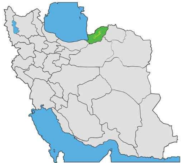
Fig. 1: Location of Golestan Province in Iran, showed in green color

This descriptive cross-sectional study was conducted from Feb to Jun 2017 in Gorgan City, capital of Golestan Province, Southeastern the Caspian Sea, north of Iran (Fig. 1).