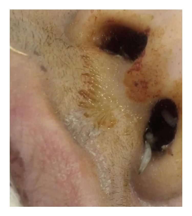
Fig. 1: Larvae, which are moving out of the nasal cavity

The pathological specimens contained three live larvae measuring about 1 cm in length and 0.1 cm in diameter. The direct wet mount microscopy was used for the initial diagnosis (Fig.