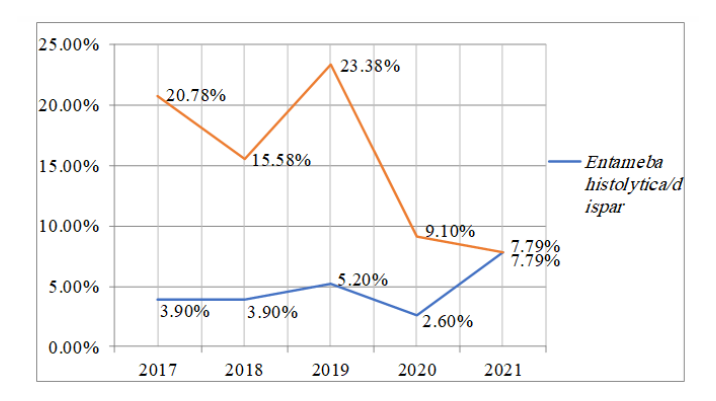
Fig. 1: The rate of intestinal protozoan over five years, 2017 to 2021 at MTUTH