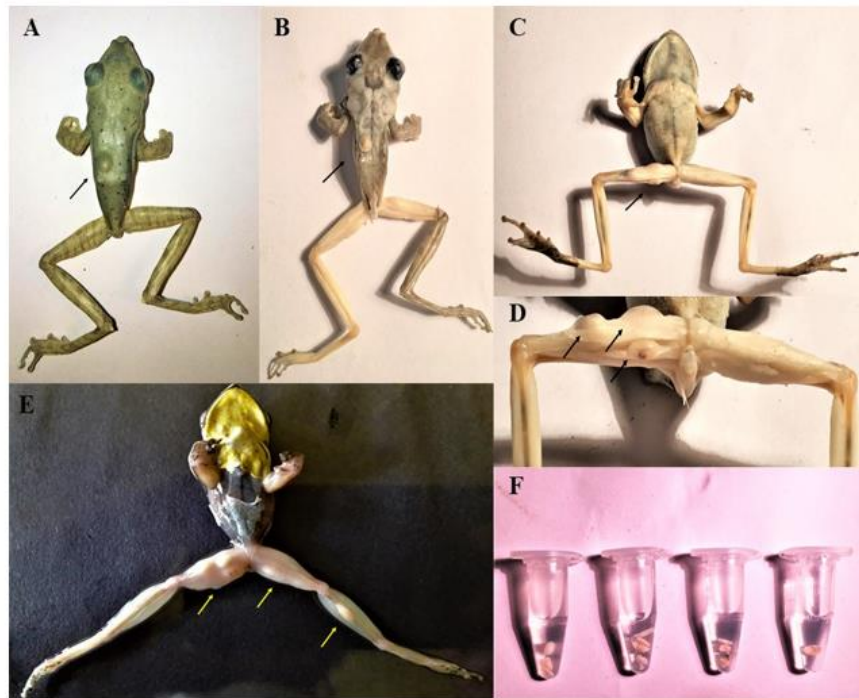
Fig. 2: Parasitization sites in T. eques frogs. A-F: Parasitization in skeletal muscles in backbone and thigh region of frogs. C, D: Cysts attached to the Sartorius, gracilis major and gracilis minor muscles. E- Cysts bound to the metacarpals and phalanges of hind limb bones. F- Extracted cysts from the musculature of infected frogs