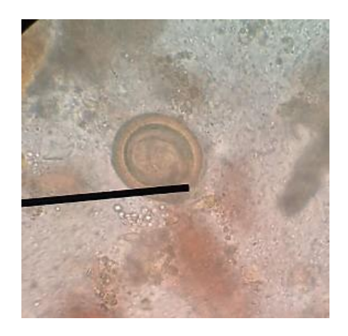
Fig. 1: Taenia spp. eggs in the Kato-Katz method (Original)

The Kato-Katz Technique was examined twice by two different researchers to reduce the subjectivity factor. All those 400 slides were positive with the soil transmitted helminths and Taenia spp. eggs. The eggs of Tae nia spp. stained with Kato-Katz method appear to be round-oval with a size of about 35 \mu , brownish yellow color, and the visible contents are hexacanth embryo covered with two layers of walls with a structure resembling a cart-wheel (Fig. 1).