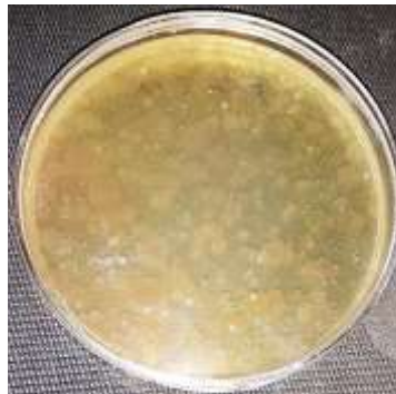
Fig 1. Double Agar Overlay plate used to separate phage. Clear areas were phage plaques. This plate was from before the optimization experiments

of the culture medium was 7. The results of the optimization tests are shown in Figure 2. Isolated phage plaques were formed as distinct transparent dots on the plate surface in these optimized conditions. Figure 3 shows the image of a Double Agar Overlay plate after optimizing the isolated bacteriophage growth conditions.