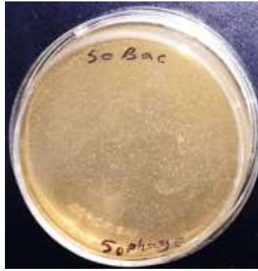
Fig. 3. Double Agar Overlay plate used after the optimization of the isolated bacteriophage growth conditions. In optimized conditions, isolated phage plaques were formed as distinct clear dots on the plate surface.