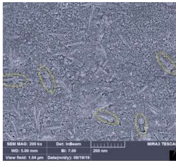
Fig. 4. Scanning electron microscopic image of the phage isolate with a magnification of 200 kx