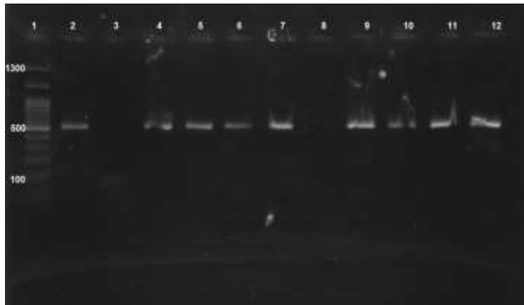
Fig. 1. Observation of PCR-products of beta-globin gene: Lane 1 is DNA size marker, lane 2 is a positive control, lane 3 is a negative control, and the other lanes are samples.