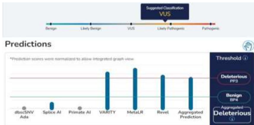
Fig. 3. Franklin database suggested the c.198A>C variant in exon 2 is likely pathogenic, as the VARIETY, MetaLR, Revel scores, and aggregated prediction indicate that this variant is deleterious.