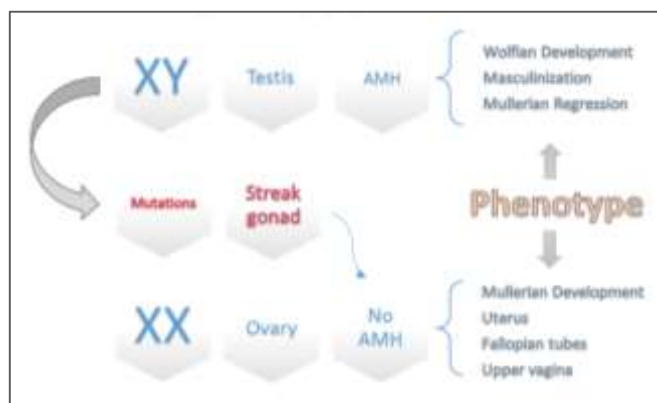
Fig.4. A schematic diagram of different pathways of sexual development interacted with AMH.

Some of these genes include SOX9 , DAX1 , WT-1 , and SF1 , which play a role in either regulating SRY or activating downstream transcription of SRY for testis-determining pathway, as well as abnormalities with the SRY protein can also lead to issues with the secretion of Testosterone and AMH (secondary sexual characteristics) [20]. This can lead to the Wolffian duct not developing into the male reproductive tract. On the other hand, without the Müllerian-inhibiting factor or androgen action, the Müllerian duct can differentiate into the oviducts, uterus, cervix, and upper vagina (Fig. 4) [21]. With the medical examinations and counseling performed by the geneticist specialist in our department, it was found that the lady had a twin brother who died during the intrauterine period, and the blood supply between the two fetuses has been shared; it can be assumed that she is a chimera by feto–fetal transfusion during pregnancy [7]. The term “chimera” refers to an organism that contains cells from two or more zygotes. There are three types of chimerism: artificial, tetragametic, and twin. Artificial chimerism can occur when