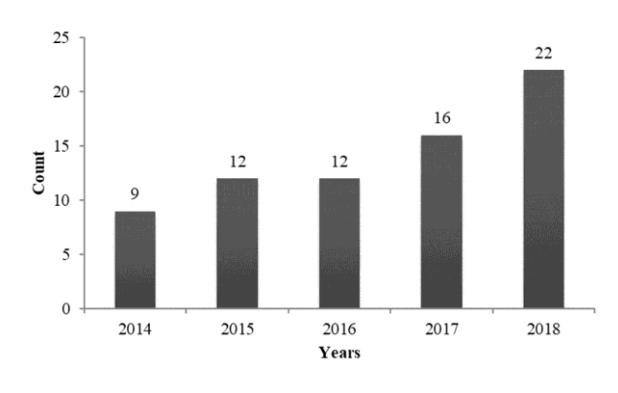
Fig. 1. Distribution of CRKP isolates by years

Carbapenemase genes analysis. Fig. 2. shows the results of molecular tests for the detection of genes encoding the carbapenemase. The PCR products of the bla_{\text{KPC}} , bla_{\text{VIM}} , bla_{\text{IMP}} , bla_{\text{NDM}} and bla_{\text{OXA-48}} genes