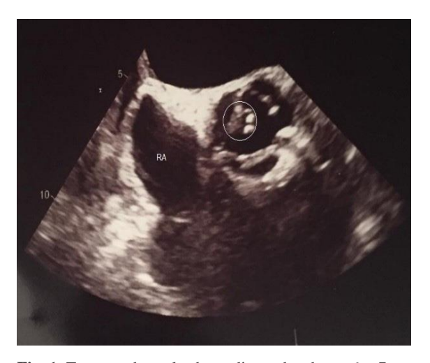
Fig. 1. Transesophageal echocardiography shows 6 \times 7 mm vegetation (white circle) on the NCC